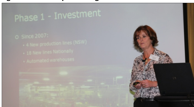
Figure 1: Vireena presenting at the Forum

Even though "we gave them the tools" the Leadership Team at the Northmead plant recognised that although many successful outcomes were being achieved by their Operational Excellence (OE) Program, a drive to increase Overall Equipment Effectiveness (OEE) across all manufacturing lines required an extra element to be introduced into their OE Program Strategy.