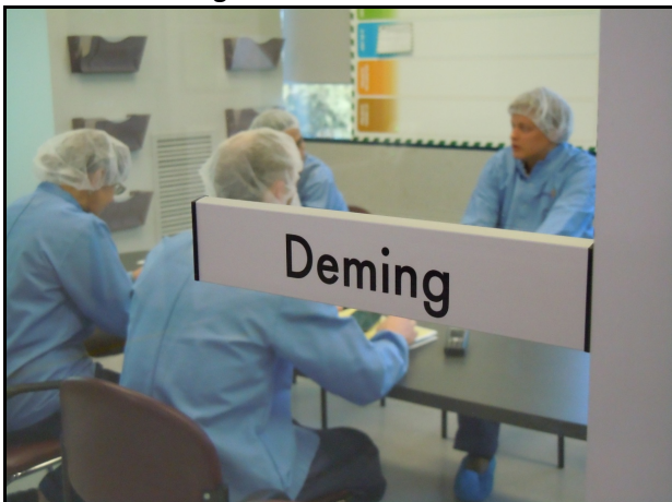
Figure 1: The Deming Room being used for a TPM 3 meeting

William Edwards Deming (1900 - 1993) is well known for his promotion of the "Plan-Do-Check-Act" improvement cycle (actually developed by Dr Shewhart, but now often called the Deming Cycle). Deming is also very well known for the work he did to assist manufacturing and business in post-war Japan.