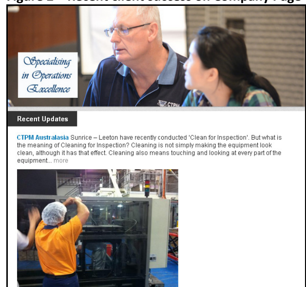
Figure 2 – Recent client success on Company Page

We update our company page weekly with what is happening in regards to workshops, material updates and client successes. Each week a highlight of the previous week will be posted with a photo to make sure CTPM followers are constantly kept up to date with our latest news.