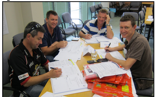
Figure 3 – Mars Petcare team hard at work!