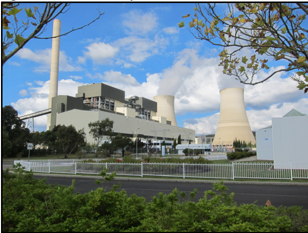
Figure 1 – Delta's Mt Piper Power Station

Delegates came from as far as Bathurst to attend the workshop which kicked off with a tour of the power station. During the tour the delegates were lucky enough to witness the impressive view from the top of the station which highlighted the vastness of the site especially its extensive coal handling facilities.