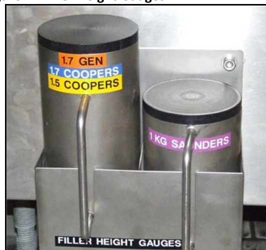
Figure 1 - Filler Height Gauges